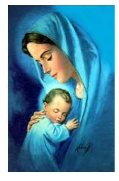
Holy Mary, Mother of God pray for us!